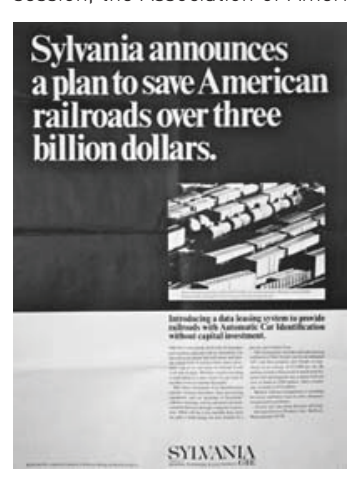
Wall Street Journal ad announcing Rail Data plan

This plan had immediate industry appeal, but several large railroads were concerned about loss of control of their data. So in an emergency session, the Association of American Railroads called for a test of all